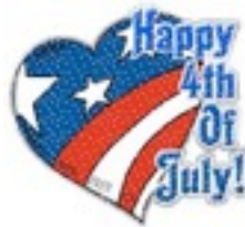
We Banner Steal