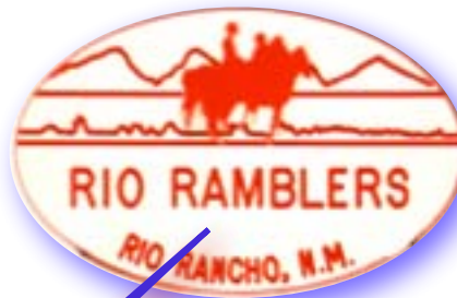
We Banner Steal